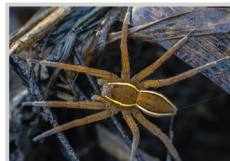
Fen Raft Spider