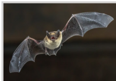
Common Pipistrelle Bat