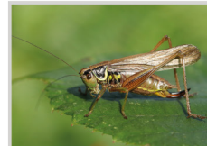
Roesel's Bush Cricket