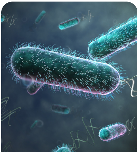
E. coli (bacteria)